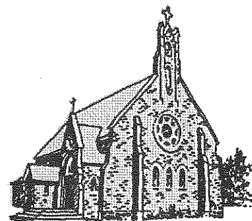
ST. MARY'S, ACHILL EST. 1875